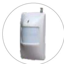
Wireless PIR (human body) Sensor