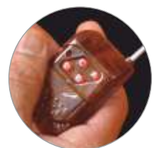
Wireless panic switch