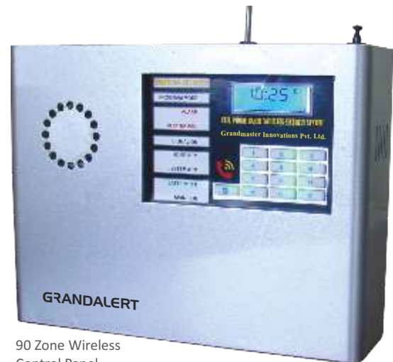
90 Zone Wireless Control Panel

Each zone can be separately armed or disarmed