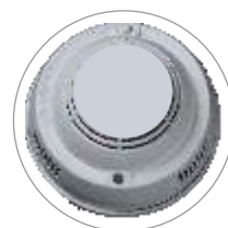
Wireless smoke detector