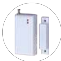
Wireless door/ Window / shutter / Strong room Sensor